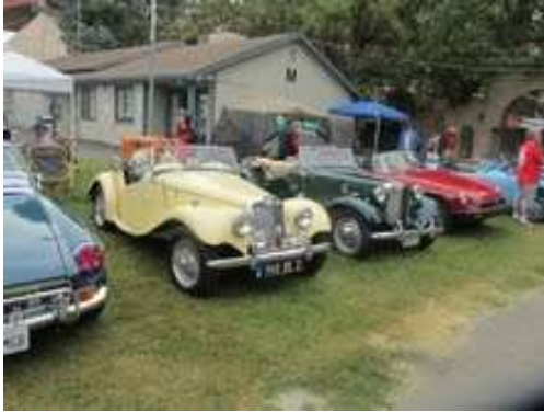
MGs at the Games in 2012

rather uninspired family saloons put out by the British Leyland Group. Upon British Leyland's demise in the early 1990's, the brand was taken over by the Rover group, which reintroduced several new sports models under the MG marque. In 2005, the Rover group was purchased by a Chinese company, but production of the MG continues in the UK, the last new model being the MG 6 in 2011.