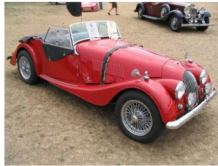
Morgan Plus-4, 1963

Morgans have had a variety of engines over the years, ranging from air or liquid-cooled motorcycle engines in the early years, through Ford and Triumph engines in the 1950's and 1960's, to a Rover V8 in the 1980's and 1990's. Recent models have featured BMW and Ford Mondeo engines.